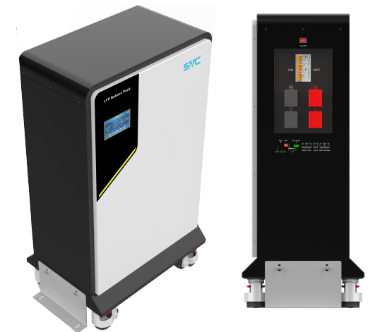
RESIDENTIAL BATTERY MODULE